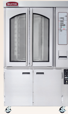
OV310 Mini Rotating Rack Oven with Optional Proofer Cabinet Base