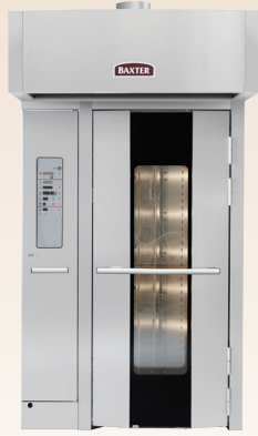
OV500G1EE Rotating Single Rack Gas Oven with Advanced Digital Control