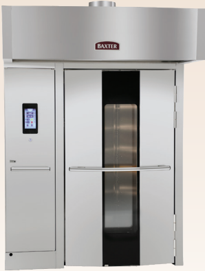
OV520G2 Rotating Double Rack Gas Oven with Smart Touch™ Control