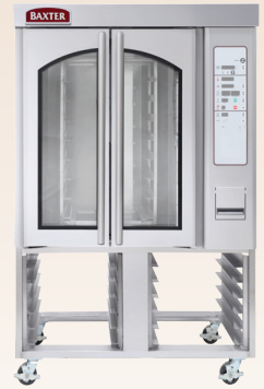
OV310 Mini Rotating Rack Oven with Optional Stand Base